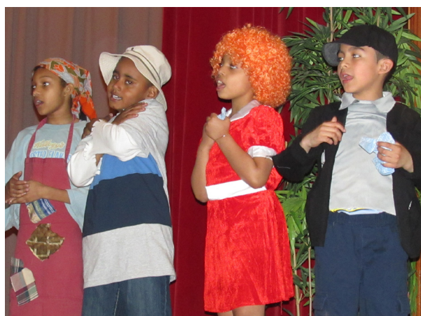
Spring Show Performs Broadway Hits