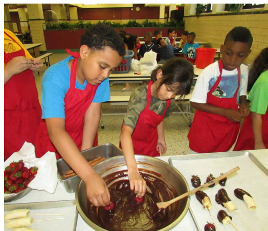
Culinary Fun at Summer Camp