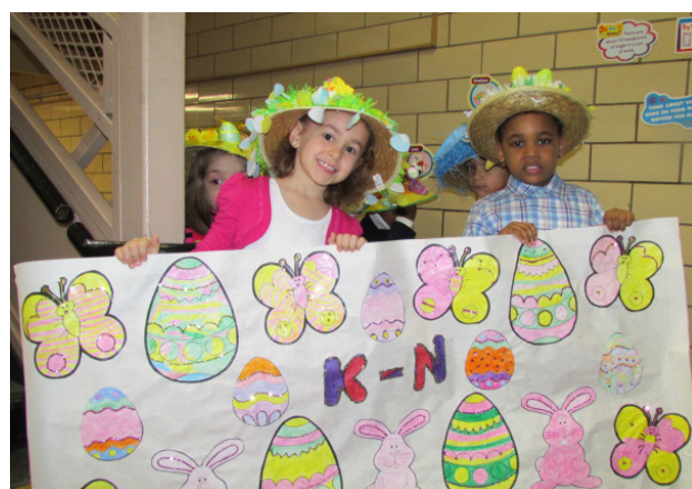
Our Easter Parade