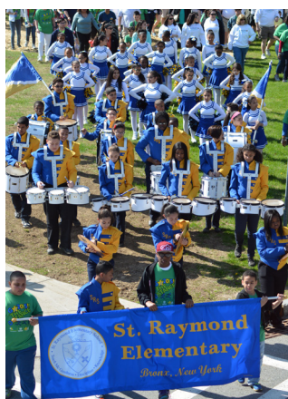
Our Band Performs at Maria Fareri Children's Hospital Event