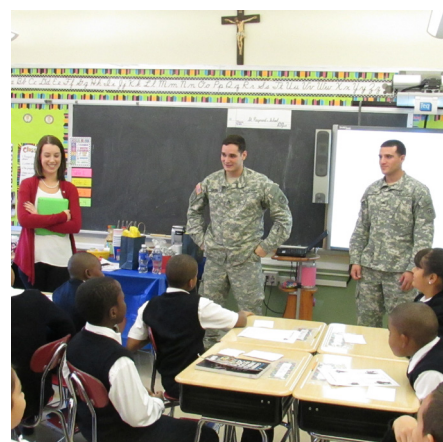
Soldiers Visit Fifth Grade