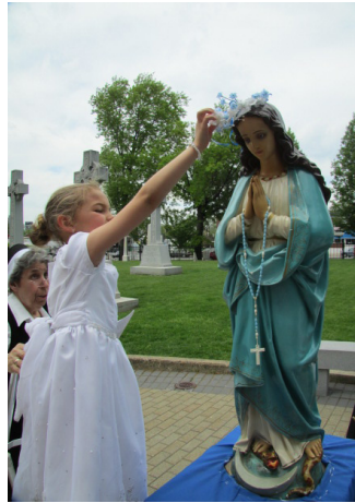
May Crowning of Our Lady