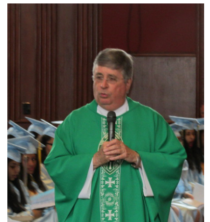
The End of Year Mass