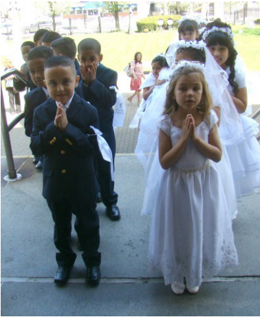
Making Their First Holy Communion