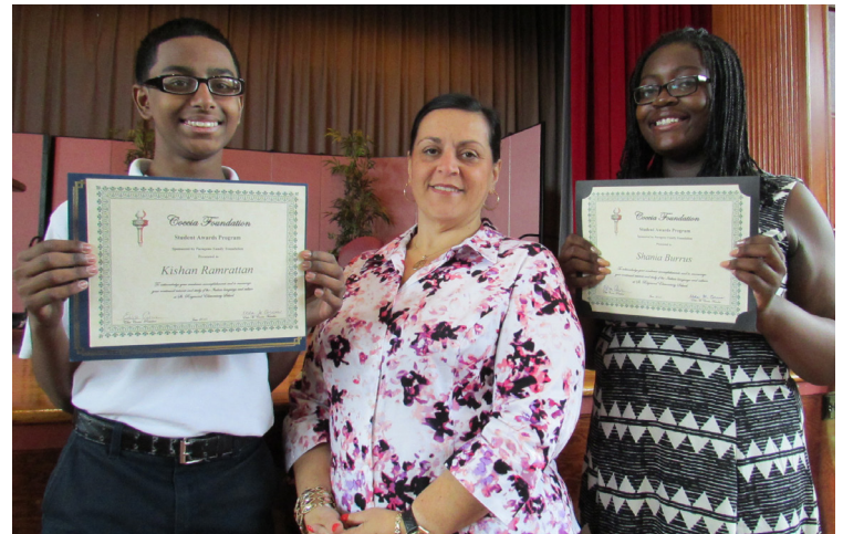
Students Excel in Italian