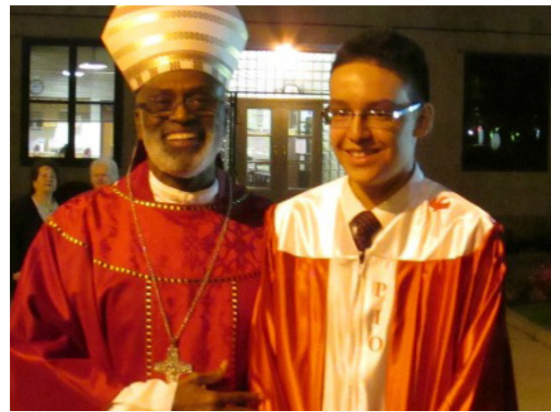
Archbishop Buckle Again Confirmation Celebrant