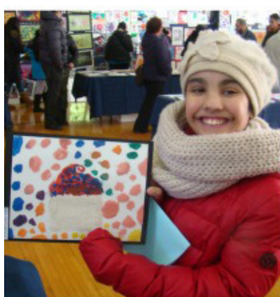
5th Annual Parish Art Show