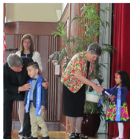
Pre-K and Kindergarten Move Up