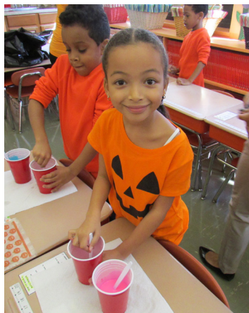
Halloween Science Lesson for First Graders