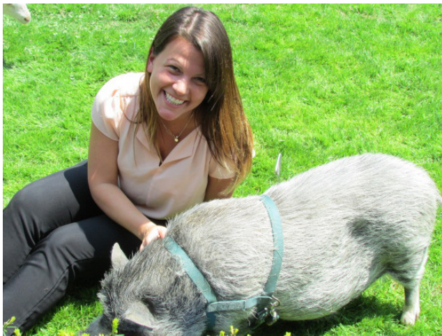
Petting Zoos Visit Our School